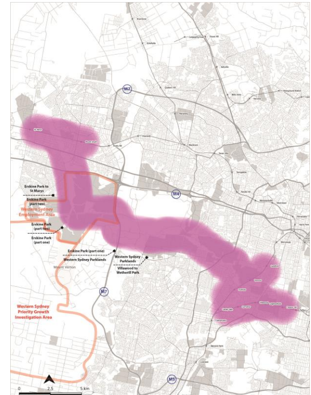
Infrastructure Australia - Mapping analysis of Infrastructure Priority List corridor protection initiatives - Western Sydney Freight Line and Intermodal Terminal Areas May 2017